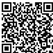
Online CE Class

Satisfy the Commission's continuing education requirements online around your schedule within 30 days. No final exams are required. Upon successful completion, you will receive a certificate, and hours will be reported on your behalf to the appropriate Commission.