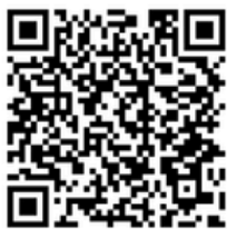
Online CE Class

Satisfy the Commission's continuing education requirements online around your schedule within 30 days. No final exams are required. Upon successful completion, you will receive a certificate, and hours will be reported on your behalf to the appropriate Commission.